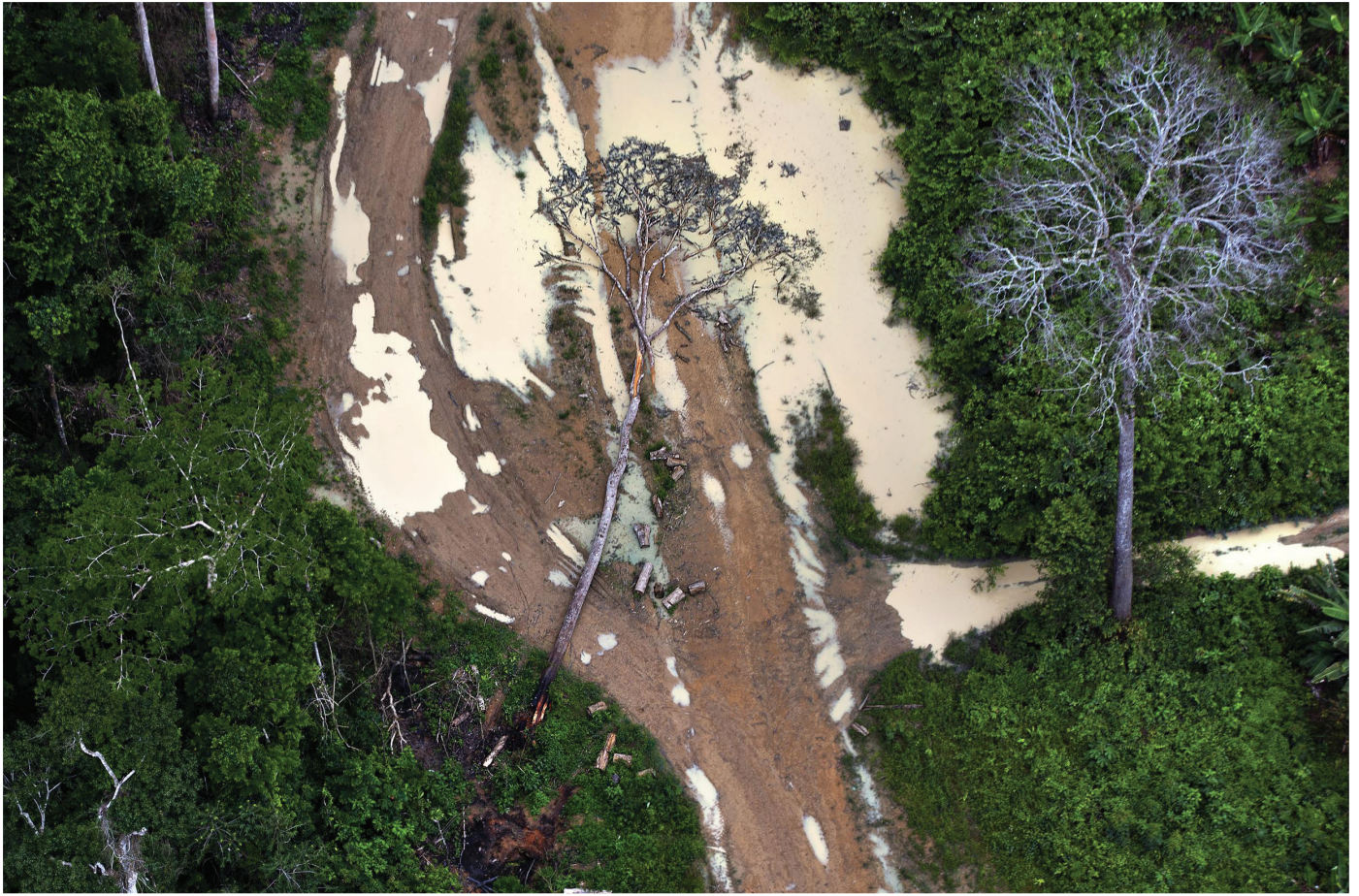
Logging in Para State Evidence of logging in Uruará, Pará State is seen from the air. 03/29/2014