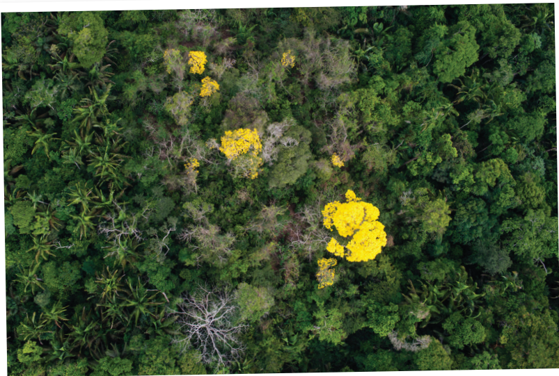
Ipê Tree Flowering in Para State Brazil 09/18/2013

In spite of this regulatory system, however, the Amazon is awash with illegal timber. Timber may be illegal because it comes from land on a private estate that has been clear-felled without a deforestation authorisation, or logged without an AUTEF; because it has been harvested in excess of the maximum authorised for a given area; or because it has been taken without permission from public land, or even from areas protected for wildlife or indigenous peoples and other communities. Between 2007 and 2012, unauthorised logging in Pará state alone covered 717,000ha, 79% of the total logging (905,000ha). 4